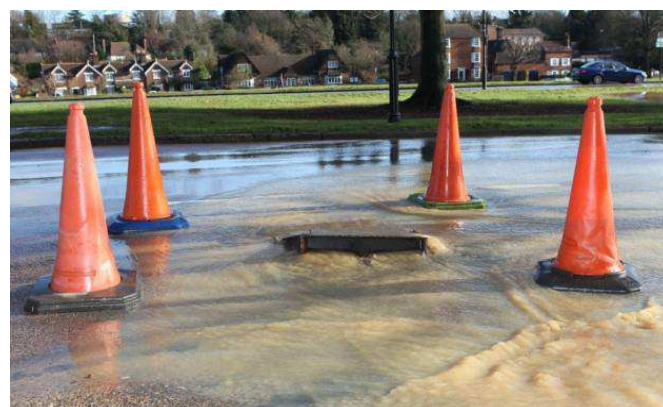
Surcharged manhole (the sewer system has reached its capacity and water escapes), Harpenden

Sewer flooding is caused when a blockage occurs in a sewer or by excess surface water entering the underground sewer network and the volume exceeding the available capacity. This can occur during periods of heavy rainfall when the drainage network becomes overwhelmed.