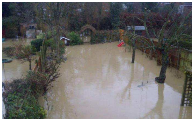
Surface water flooding in residential gardens, Puckeridge

drainage capacity is unable to cope with the volume of water experienced during periods of sustained or heavy rainfall. Flooding then results from overland flows causing ponding of water where it becomes obstructed or collects in low lying areas.