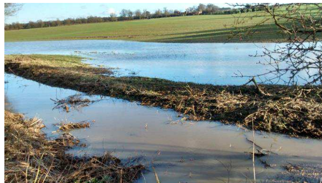
Watercourse flowing out of bank, Robbery Bottom Lane

that High risk watercourses will be inspected every 5 years, Medium risk watercourses, every 7 years and Low risk watercourses being inspected on notification of an issue.