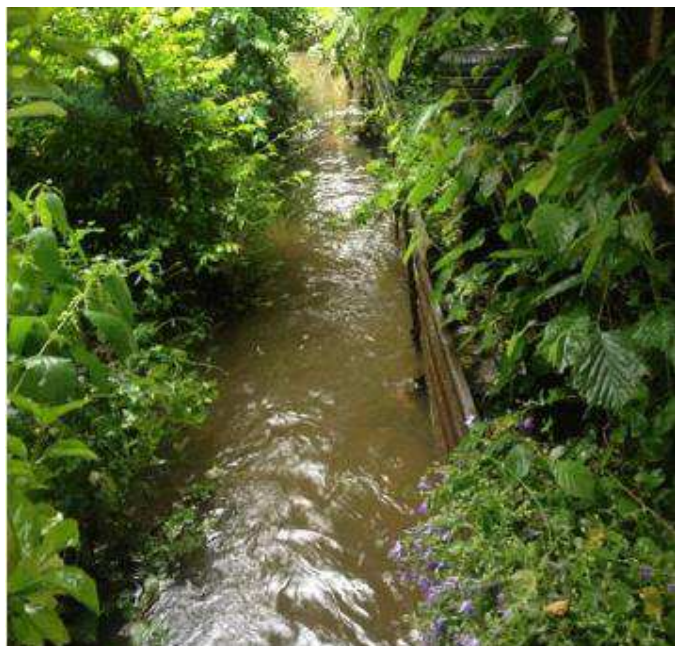
Ordinary watercourse bordering back gardens, Bushey

intended that this fund will only be used where responsibility cannot be assigned or when alternative sources of funding cannot be obtained.