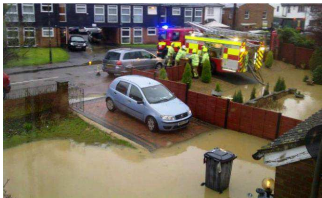
Fire & Rescue Service responding to property flooding, Puckeridge

The LLFA is not an emergency responder and residents of Hertfordshire should be prepared to protect their property if it is at risk. It is important to understand the limitations of the responders that do attend flooding such as the fire and rescue service will prioritise their attendance to flooded sites if there is a risk to life, e.g. if electrics are likely to be flooded.