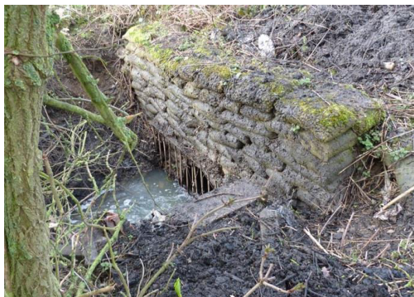
Neglected and unsuitable structure in an Ordinary Watercourse

A map of the ordinary watercourses in Hertfordshire can be viewed under "Water Management Map" at: https://gisinfo.hertfordshire.gov.uk/