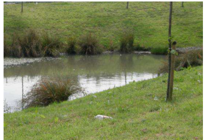
Retention basin, Hoddesdon

Hertfordshire County Council as the LLFA for Hertfordshire is a statutory consultee on surface water drainage in relation to major planning applications. This role is to ensure that new major development does not contribute to increased flood risk from surface water and that surface water arising from the development is managed in a sustainable way; prioritising the use of sustainable drainage systems (SuDS).