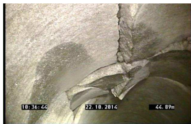
Image taken from a CCTV survey of a cracked and failing asset

In support of 9, the LLFA will develop suitable performance indicators linked to the asset register considering aspects such as target condition and an inspection programme.