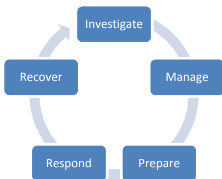
Flood Risk Management Cycle

always be some level of flood risk that cannot be removed.