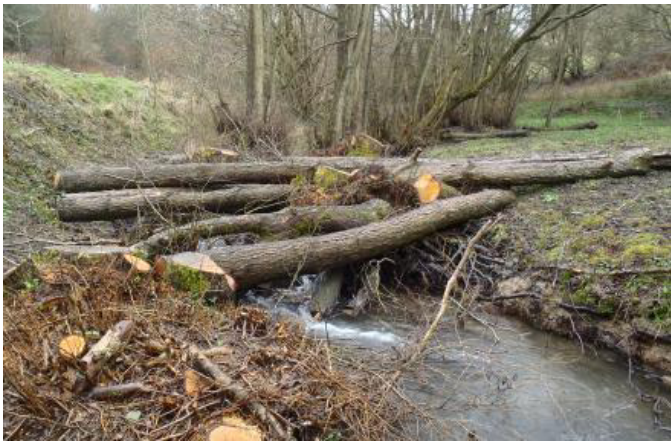
Natural Flood Management Scheme, Stroud

Working with Thames Water Utilities Ltd and Anglian Water Services the LLFA will seek to identify areas for the retrofitting of SuDS where there is insufficient capacity in surface water sewers.