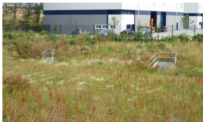
SuDS attenuation basin, Bourne End, Dacorum