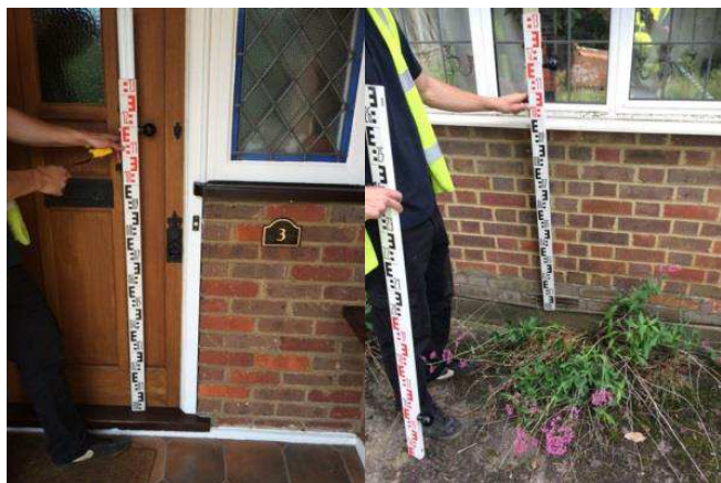
Surveying of property threshold levels for use in flood modelling

Outputs from each SWMP include: a detailed risk assessment; flood modelling and mapping of vulnerable areas; and an action plan which explores the most cost effective way of managing surface water flood risk in the long term. SWMPs will identify and prioritise practical actions to mitigate flood risk and will have other applications e.g. for planners and others involved in the development process.