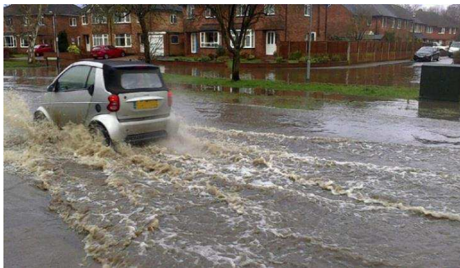
Flooding affecting the highway, Welwyn Garden City

Whether it involves residential or commercial property; infrastructure such as roads and substations; or other local amenities; flooding can cause substantial physical, financial and emotional damage; adversely affecting communities, the local economy and quality of life.