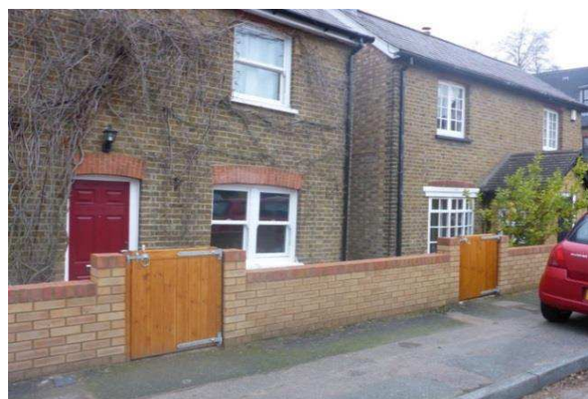
Boundary wall and flood gates, Bishops Stortford