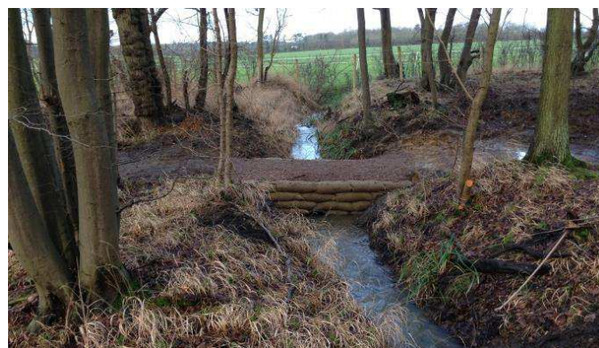
Structure with culvert across an ordinary watercourse, Oxhey Woods

Details on how the ordinary watercourse risk score is defined and how it guides the inspection routine are set out within the Ordinary Watercourse Service Standards: https://www.hertfordshire.gov.uk/services/recycling-waste-and-environment/water/ordinary-watercourses/ordinary-watercourses.aspx