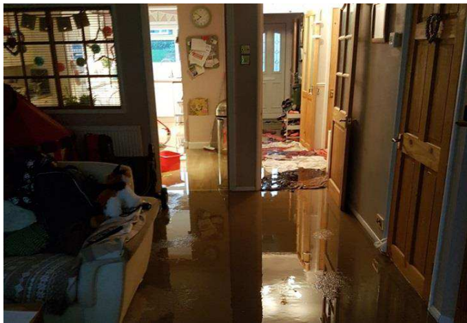
Internal property flooding

Flooding due to intense or prolonged rainfall is an environmental risk that needs to be understood.