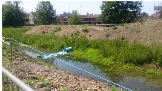
Unconsented works in an Ordinary Watercourse, Bishops Stortford

In two tier local authority areas, the Flood and Water Management Act 2010 resulted in powers relating to ordinary watercourses being divided between the LLFA and district or borough councils. The LLFA holds the powers of consenting and enforcement under Sections 23, 24 and 25 of the Land Drainage Act 1991 and district or borough councils hold the powers to manage flood risk from ordinary watercourses under Section 14A. Although the district and borough councils are all subject to the same duties and have the same powers available to them, they do not operate to a standardised approach to flood risk management activity linked to Ordinary Watercourses across the county.