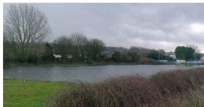
Groundwater emergence and extensive ponding, Cow Roast, Dacorum

Groundwater flooding occurs when the water held underground rises to a level where it breaks the surface in areas away from the usual channels and drainage pathways. It is generally a result of extended periods of heavy rain, but can also occur as a result of reduced abstraction, underground leaks or the displacement of underground water flows. Once groundwater flooding occurs, the water can remain at the surface for an extended period of time.