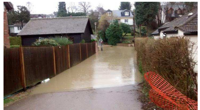
Flooding in Robbery Bottom Lane, Welwyn

In Hertfordshire the main sources of flood risk are surface water, rivers and other watercourses (fluvial) and, less frequently, groundwater. The LLFA published the second Preliminary Flood Risk Assessment for Hertfordshire in 2017, this confirmed that local flood risk in Hertfordshire (mainly surface water) is not concentrated in a few locations but is distributed across the county. This assessment also considered flood risk from ordinary watercourses and groundwater which was found to represent only a small proportion of reported flooding.