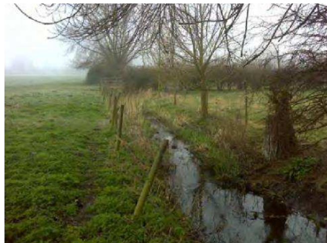
Potential for Natural Flood Management, Long Marston