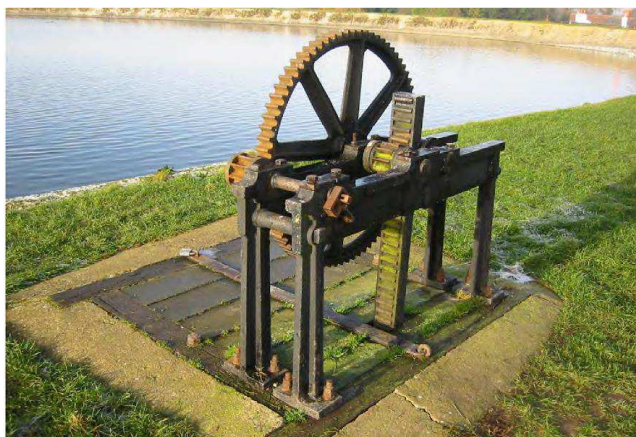
Tring's Startops Reservoir Outflow Sluice

Grand Union Canal, the Lee Navigation and the Stort Navigation. It is considered that there are no significant flood risks associated expressly with the canals.